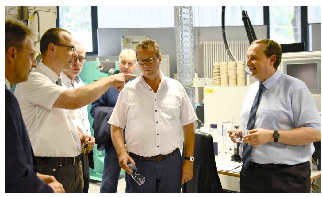
Minister of Agriculture Hauk visits DITF's Carbon Fiber Technology Centre

made of polyacrylonitrile and very expensive. Researchers expect a significant reduction in production costs and an improvement of the ecological balance for carbon fiber manufacturing based on cellulose and lignin fibers. Beech wood is a suitable resource for this purpose. On a laboratory scale, the