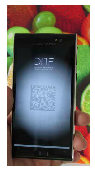
Smartphone with DITF app for decoding the security code

Point of contact: Reinhold.Schneider@ditf.de