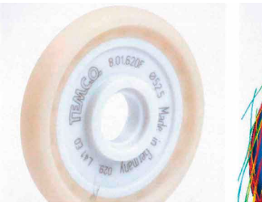
Simulation of air flows on Temco CoolFlow texturing discs

fluencing the air flows between the discs; however, the disc geometry plays a central role. The simulations of the texturing process carried out at the DITF showed that the air flow between the discs is improved with the optimized CoolFlow