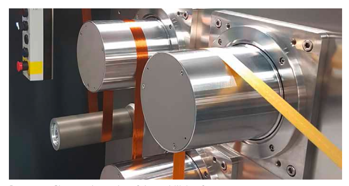
Pre-cursor fibers at the outlet of the stabilizing furnace

The successfully commissioned facility is running smoothly. The energy saving targets have been achieved. In the most recent laboratory tests, we were able to stabilize six fiber bun-