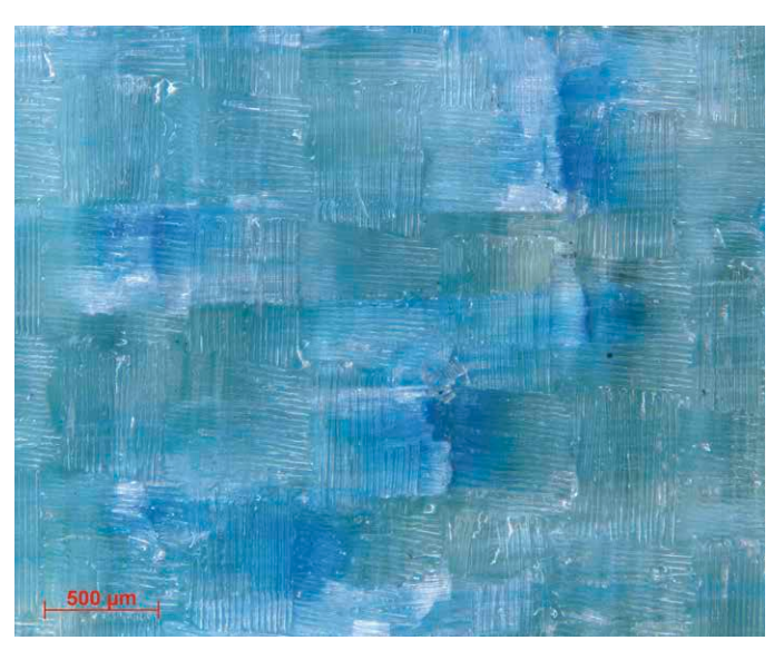
Glass hollow fiber fabric with dyed monomers

material can justifiably be called "self-healing".